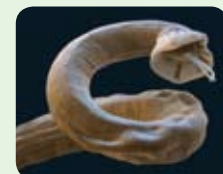
Adult A. vasorum lungworm These live in the heart and pulmonary arteries

Lungworm infestation, caused by the parasite Angiostrongylus vasorum is something that all dog owners should be aware of. Angiostrongylus vasorum can cause a wide range of symptoms – some severe, including coughing, lethargy, fits and blood clotting problems. However other pets may show no obvious signs of problems.