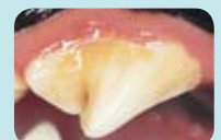
Unhealthy mouth with gingivitis and calculus